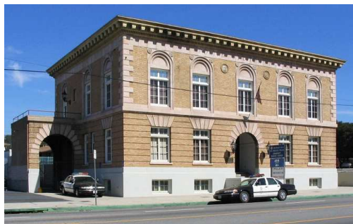
COMPUTER AT HQ