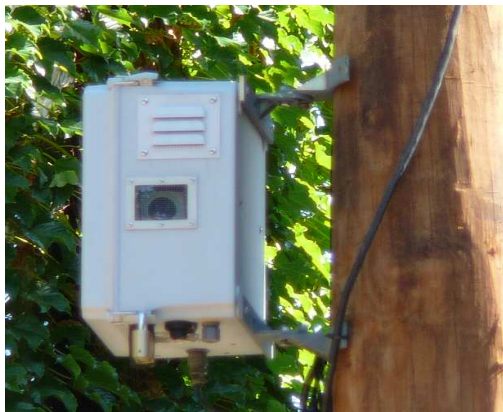
POLE MOUNT UTILITY BOX